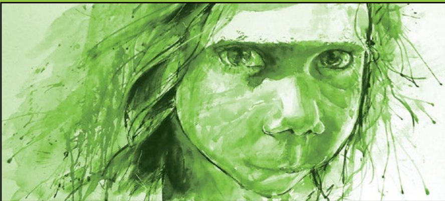
Warawi by Kerry Kerley

16 SEPTEMBER OPENING: 5PM–8PM | EXHIBITION: 17–26 SEPTEMBER | FREE: RSVP@107PROJECTS.ORG